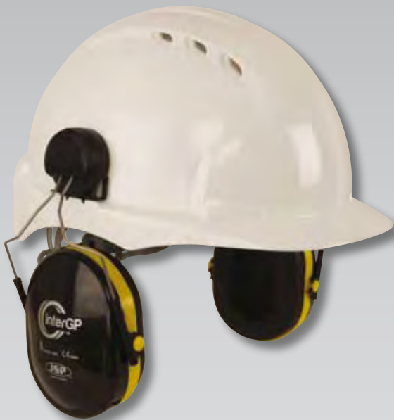
INTER GP™ EAR DEFENDERS: On a JSP EVO3® Helmet

EC Certificate Number 01748, issued by BSi Product Certification