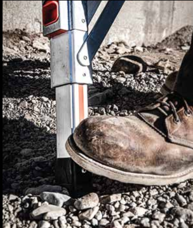
Ratchet Leg Levelers