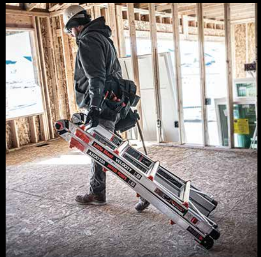
Tip & Glide Wheels