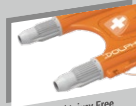
Tangle and Injury Free