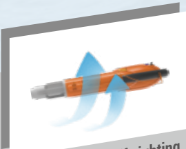
Flip Back and Self-righting