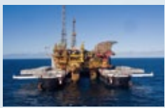
Oil & Gas Platforms