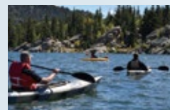
Lakes, Rivers, Reservoirs