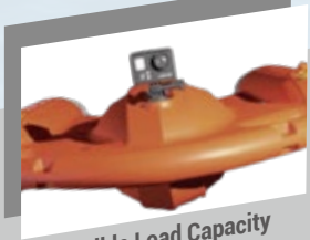
Flexible Load Capacity