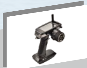
Easy to Use