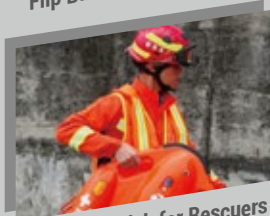
Minimized Risk for Rescuers