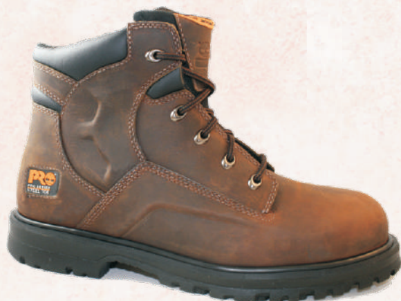
87520 6" Steel Toe Full-Grain Distressed Leather 7-11,12,13,14,15 W