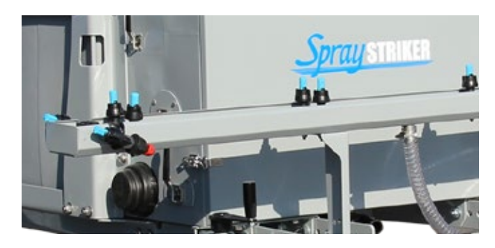
Double spray nozzles