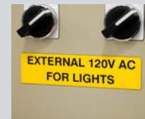
Equipment and panel labeling