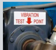
Lean / 5S labeling