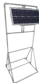
SolarPak Charger (optional)