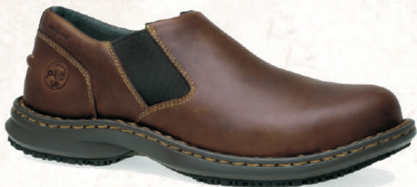
86509 Steel Toe Slip On Brown Full-Grain Leather 7-12,13,14,15M/W