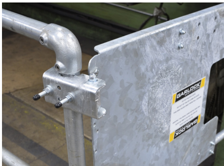
Universal Clamp Mount