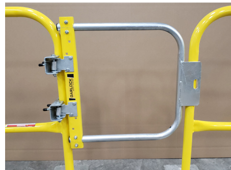
SlimFit gate for narrow openings