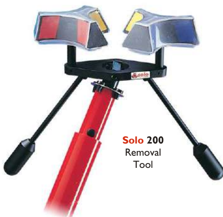
Solo 200 Removal Tool