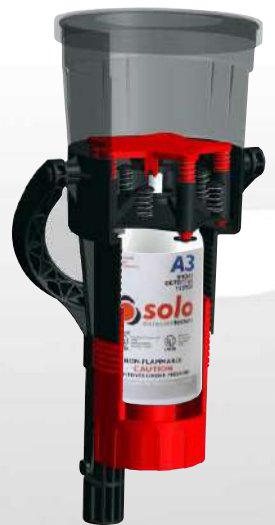
Solo 330 for use with Solo A3 & C3 Aerosols

Solo 332 is available for larger diameter detectors.