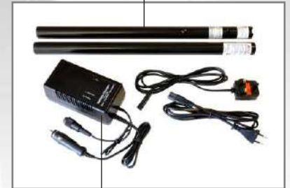
Solo 725 Fast Charger