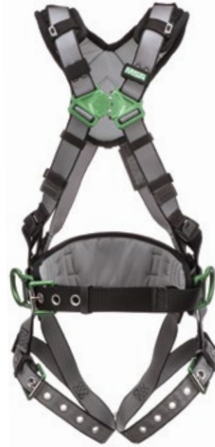
V-FIT Construction Full-Body Harness