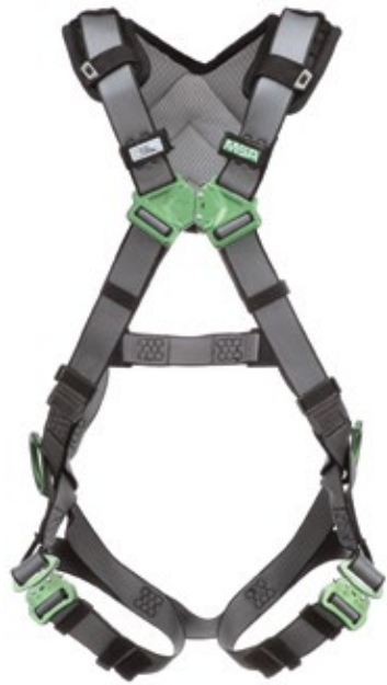
V-FIT Standard Full-Body Harness