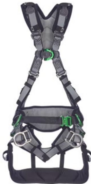
V-FIT Tower Full-Body Harness w/Front D-Ring