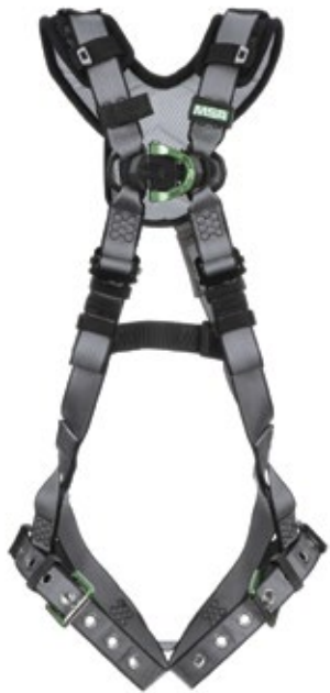
V-FIT Standard Full-Body Harness w/Front D-Ring