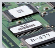
Circuit board labeling