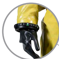
Bayonet glove ring system for quick and simple glove exchange