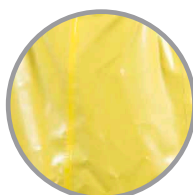
Highly chemical resistant, yet soft and flexible suit material with Viton® top coating