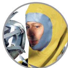
Anatomically designed face seal for optimum safety and comfort