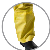
Attached boots or sewn-in socks in the suit material