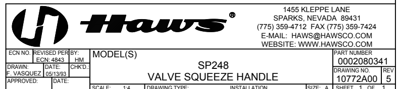
VALVE REPAIR DETAIL MODEL VRKSP248 OPTIONAL