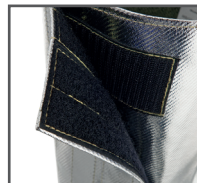
Back with hook-and-loop fastener