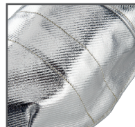
Insulated steel stripe on instep