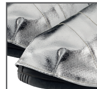
With foot darts