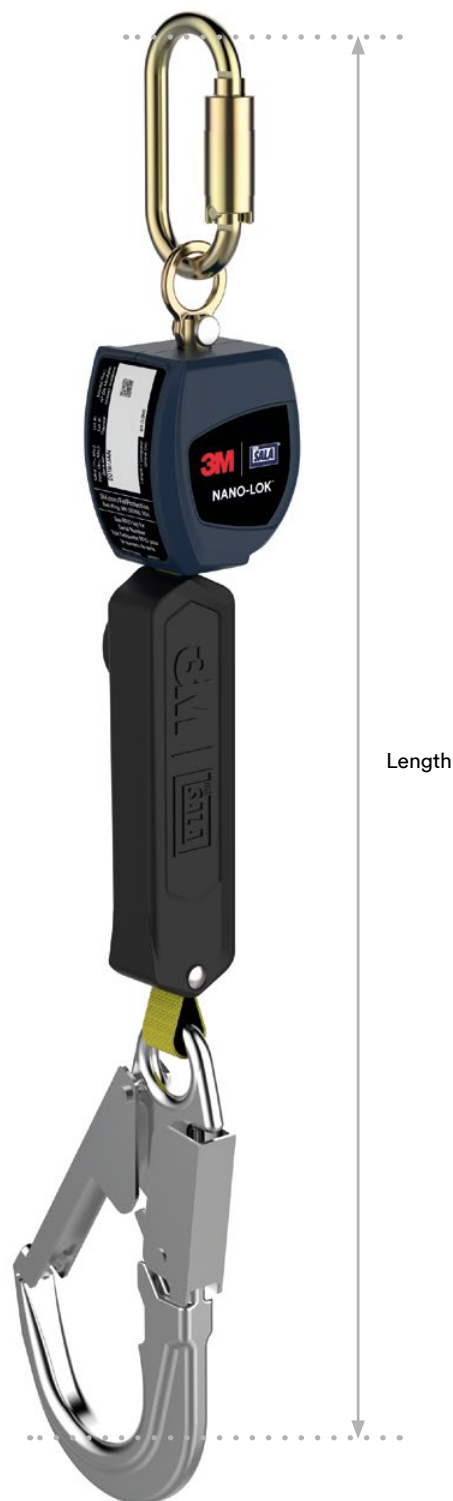
Model Shown: 3101461