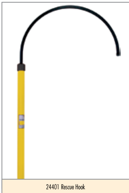
24401 Rescue Hook