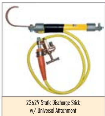
22629 Static Discharge Stick w/ Universal Attachment