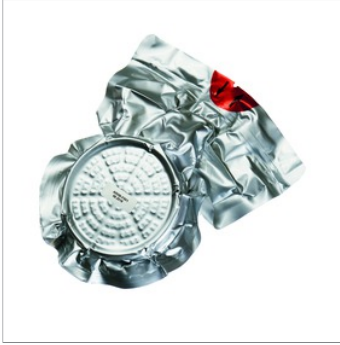
Exchange Set Dräger PARAT® 3160